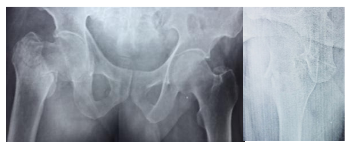
Figure 3 - Preoperative X-ray of varus malunited intertrochanteric fracture.