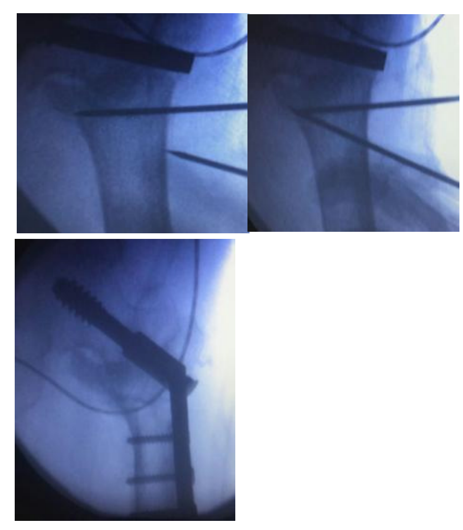
Figure 2 - Valgus osteotomy being performed

tract. From the drill hole on the lateral cortex multiple drill tracts were made both anteriorly and posteriorly to weaken the bone and for easier osteotomy using straight osteotome. A lateral based wedge of bone was removed and the osteotomy site closed by approximation of the proximal and distal segment of bone. This is achieved by abducting the limb on fracture table. The bone wedge resected was used as morcellisedbone graft for the osteotomy site as well as intertrochanteric fracture site.