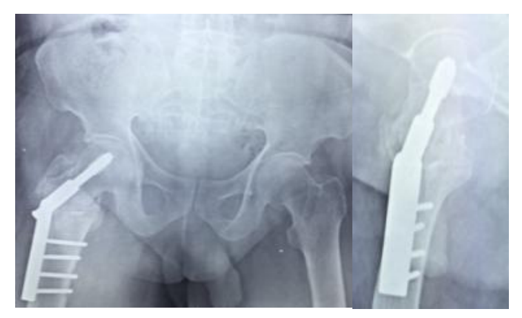
Figure 4 - Post operative xray after valgus osteotomy